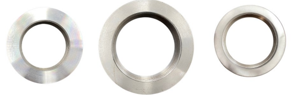
P123 Tank Boss U36 Tank Boss Z9 Tank Boss