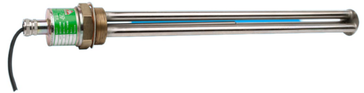
2 1/4" 230V Single Phase