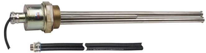
2" 230V Single Phase