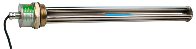
3" 230V Single Phase