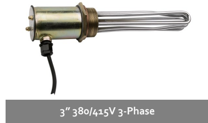
3" 380/415V 3-Phase