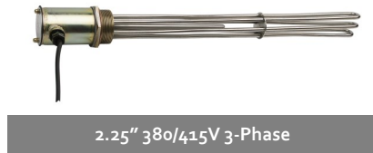
2.25" 380/415V 3-Phase