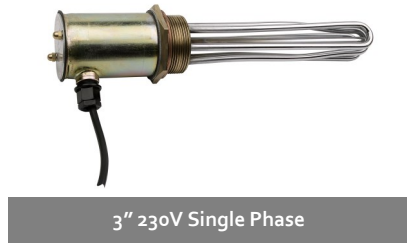
3" 230V Single Phase