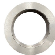
U36 Tank Boss