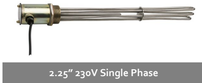
2.25" 230V Single Phase